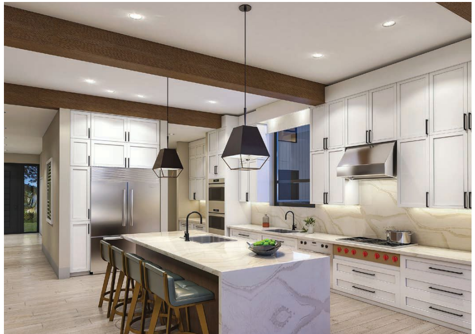
The art and science of lighting is perfected at Pendry Residences Natirar, which integrate Delos and DARWIN.

Having established a global presence in the office and hospitality sectors, Delos has evolved into a global brand. Currently, the company is also working with some of the nation's largest school districts, including New York City, Chicago, Miami-Dade and Baltimore, to provide air purification units. KW